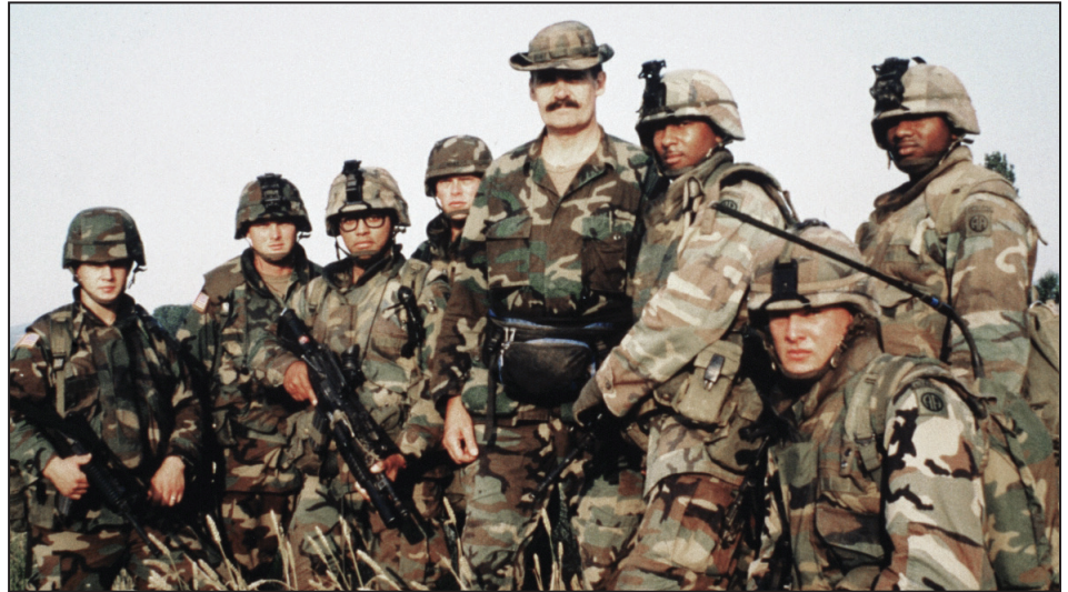
KOSOVO – Entered as guest of 82nd Airborne and Special Forces upon entry of UN forces; accompanied Special Forces in arrest of alleged war criminal. Participated with 82nd Airborne in night helicopter and foot patrols. 1999

Wrote monthly column "Your Church & the Law" for Southern Baptist magazine Church Administration . Wrote weekly column, Law and the Christian Life , which was published in the Tennessee Baptist & Reflector , Tennessee Pentecostal Voice , Hawaii Baptist , Iowa Southern Baptist News , Oklahoma Baptist Messenger , The Montana Baptist , The Michigan Baptist Beacon newspapers; articles also published on-line by Asbury Theological Seminary, among others. 1996 - 2001