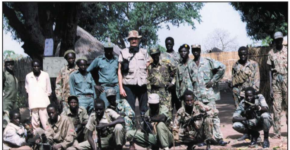
SUDAN – With the Sudanese rebel army in 1998. Entered from Kenya to observe civil war.

DESCRIPTION: 6' 7", 245 lbs., dark brown hair, blue eyes.