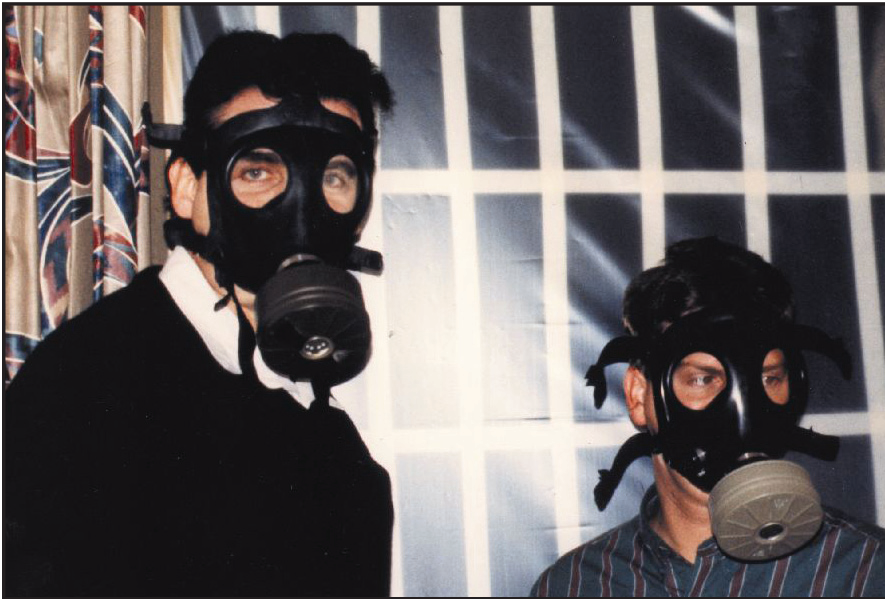
ISRAEL- during first Persian Gulf War. 1991

Articles and Predictions on Terrorism and International Issues “ Terrorism and an International Criminal Court ”, “ Terrorism and the American Military Response ” published in Memphis Commercial Appeal. For several years prior to Sept. 11, 2001, predicted in newspaper and TV commentaries that there would be a catastrophic terrorist attack against the US; in 1996 Nashville Banner article stated that “the previous World Trade Center bombing will be a pin prick rehearsal for what will follow.”